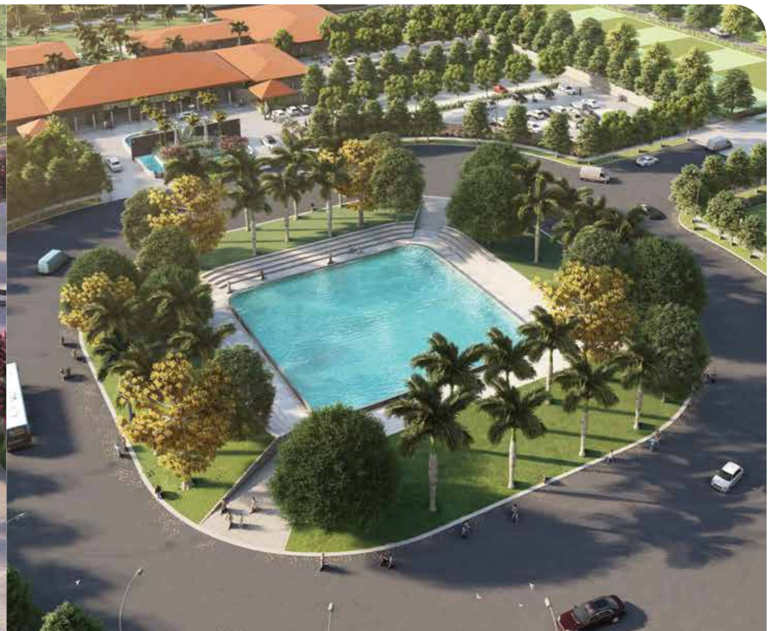
Garden of Fountains