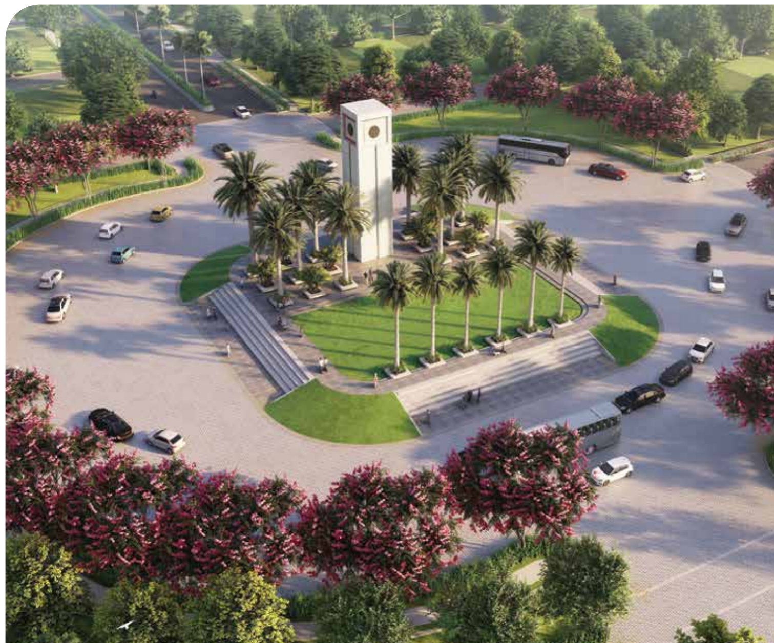
Garden of Time